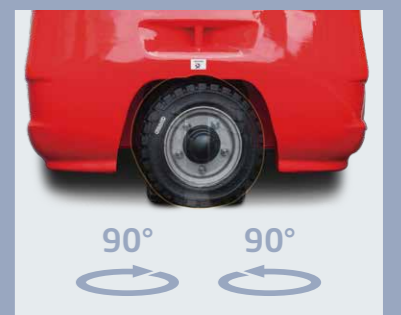
The small turning radius is suitable for narrow channel