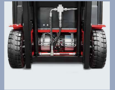
Front dual separated motors