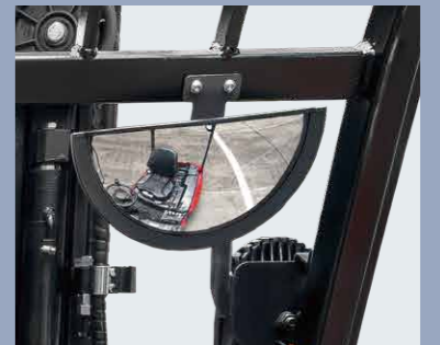
Panoramic rearview mirror